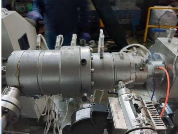
4 Pipe mould